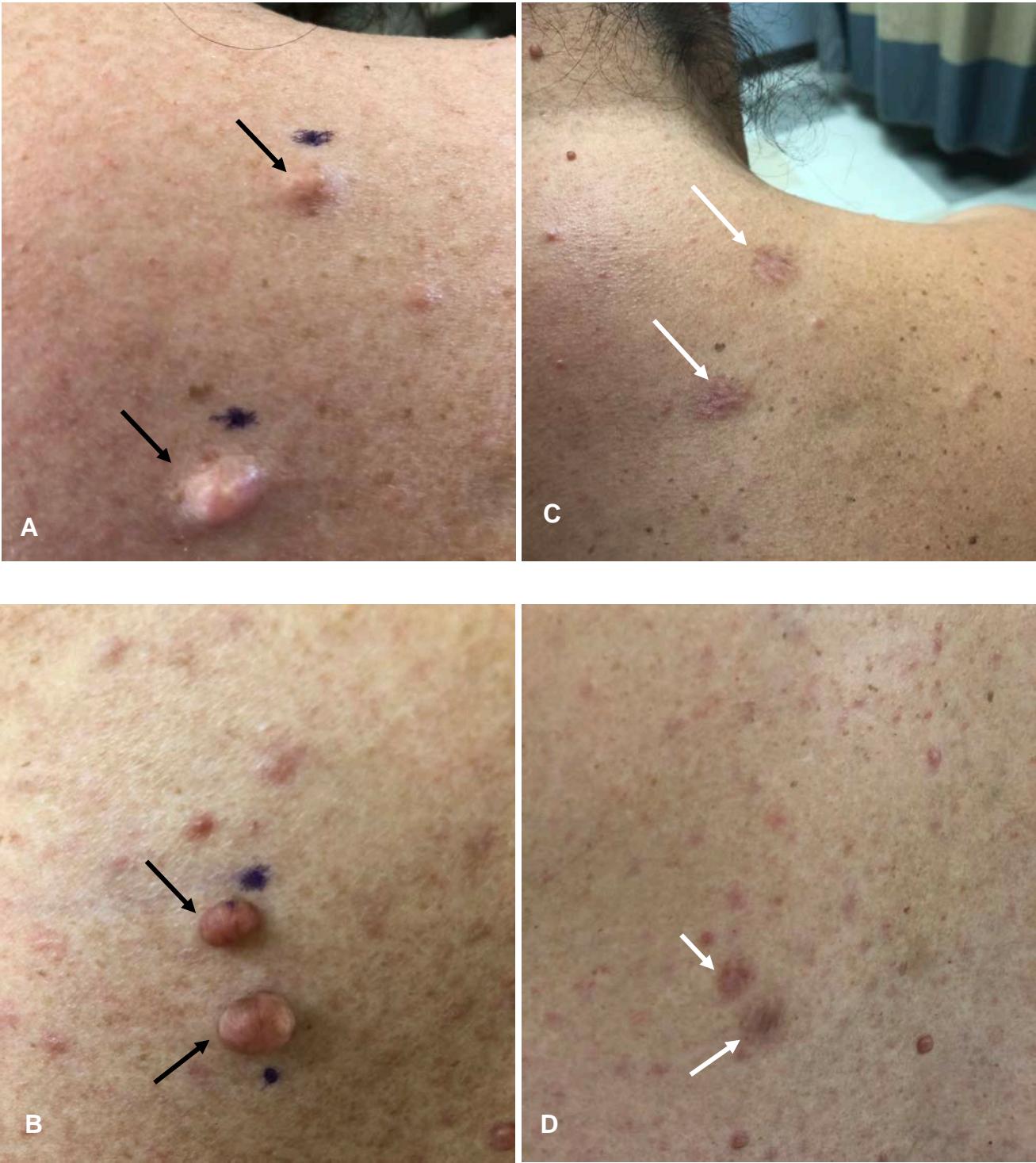
Supplemental Figure 2: Post-Inflammatory Hyperpigmentation. (A, B) Before procedure, cutaneous neurofibromas denoted with black arrow; (C,D) Five months post procedure, post-inflammatory hyperpigmentation denoted with white arrow