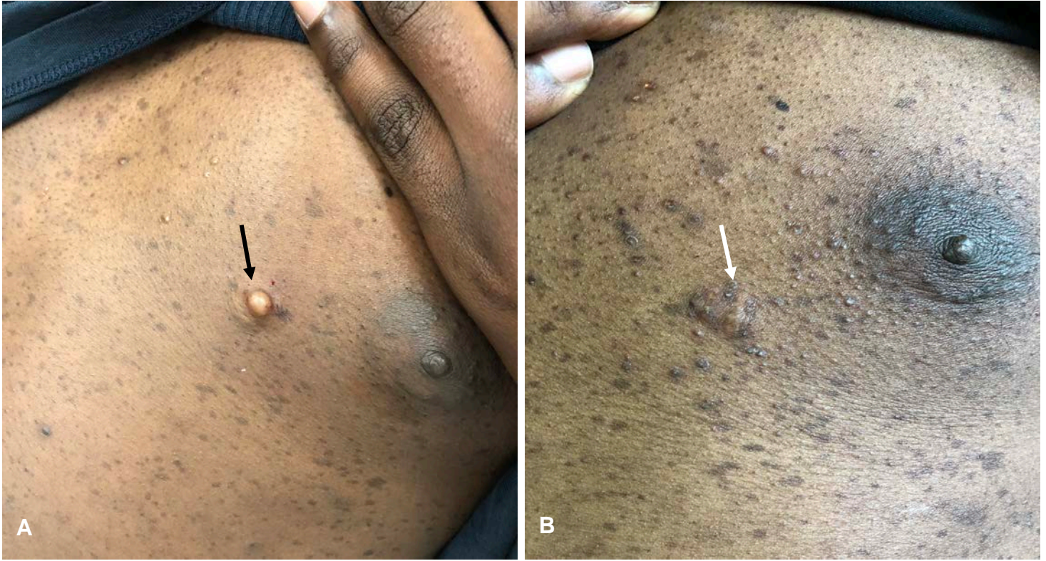
Supplemental Figure 1: 25-year-old African American male with hypertrophic scar five months after procedure. (A) Before procedure, cutaneous neurofibroma denoted with black arrow. (B) Five months post procedure, hypertrophic scar denoted with white arrow.