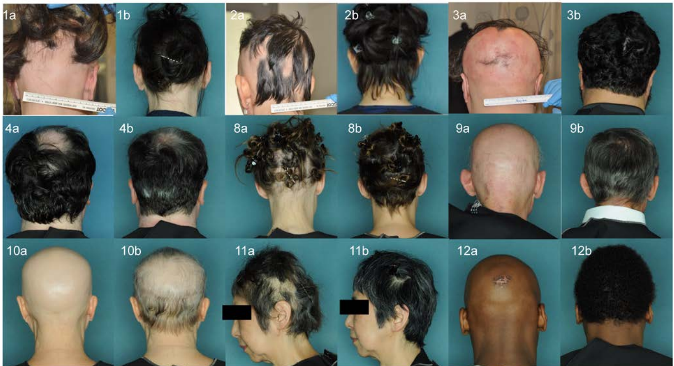
Figure 2. Clinical photographs of responder AA patients on ruxolitinib. Pairs of photographs for subjects 1, 2, 3, 4, 8, 9, 10, 11, and 12 are shown as labeled. Photographs labeled “a” in each pair were taken at baseline, and those labeled “b” were taken at the end of treatment with ruxolitinib.

taken at baseline and following 12 weeks of treatment, with additional optional biopsies performed earlier in the treatment course. Baseline scalp samples exhibited a distinct gene expression profile when compared with samples taken from unaffected patients (Figure 3A and Supplemental Table 2). Following ruxolitinib treatment, gene expression profiles of AA patient scalp samples clustered more closely with healthy control scalp samples than with baseline AA samples (Figure 3B), indicating global normalization of the AA pathogenic response. Gene expression profiles attributed to the IFN, CTL, and hair keratin (KRT) signatures were assessed in the trivariate AA disease activity index (ALADIN, Figure 3C), a summary index of the AA pathogenic inflammatory response and hair regrowth (8). Importantly, eventual AA responders clustered together on the ALADIN matrix at baseline, sharing high IFN and CTL scores (Figure 3, C and D).